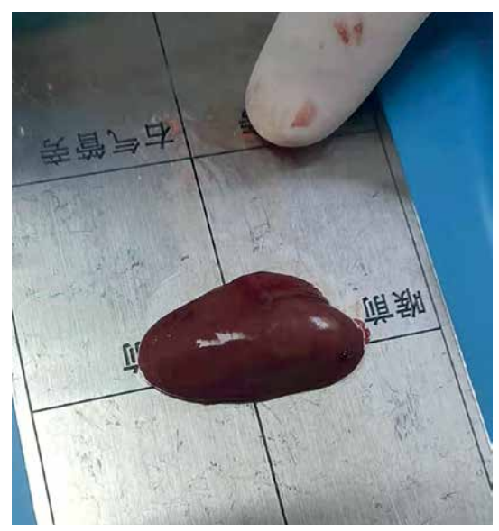
Figure 2. A hardened mass was found in the left rear side of the esophagus

Clinically, MEN1 is usually diagnosed when a patient presents with two or more MEN1-as-